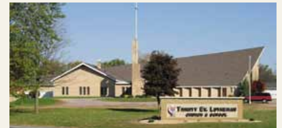
Trinity Lutheran Church