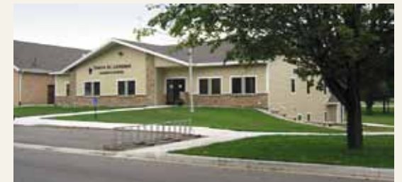
Trinity Lutheran School