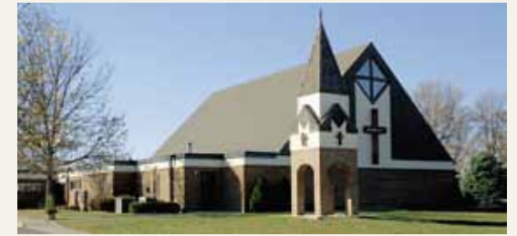
St. Paul's Catholic Church

Nicollet's city and rural churches serve the spiritual needs of its people and are an important part of the town's social structure. The two area Lutheran churches also operate Pre-K through 8 programs of parochial education.