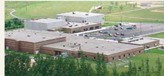
Nicollet Public School #507

Additionally, the public school aids the transition to higher education. It provides community education courses and a 2-year college program with over 45 semester credits of general education. 1 state university, 3 colleges, 1 technical college and multiple business and trade schools are located within 15 minutes of Nicollet.